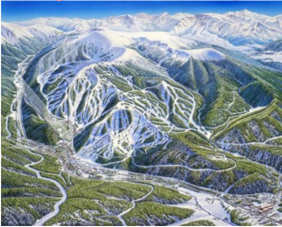
Winter Park has over 3,000 skiable acres with outstanding terrain for skiers of all levels!