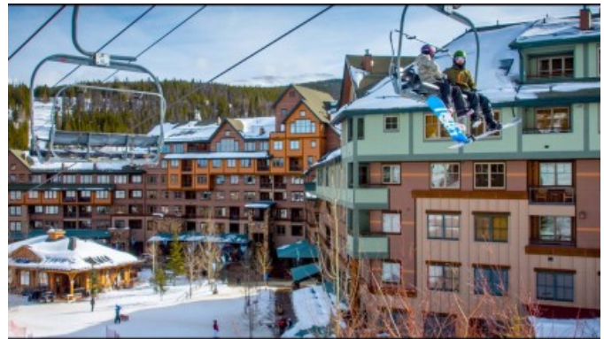
Walk out the door at Zephyr Lodge condos and you are just steps from the lift!

Winter Park is a fantastic mountain that is easy to travel to from Richmond. We have booked an afternoon DIRECT flight to Denver, with less than a 2 hr drive. We are staying at the most convenient SKI-IN, SKI-OUT accommodations in Winter Park. The high elevation provides consistent snow conditions well into March.