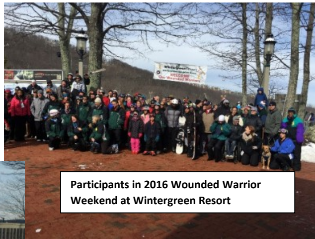
Participants in 2016 Wounded Warrior Weekend at Wintergreen Resort