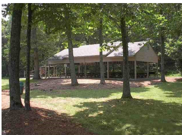
Chestnut Spring Pavilion