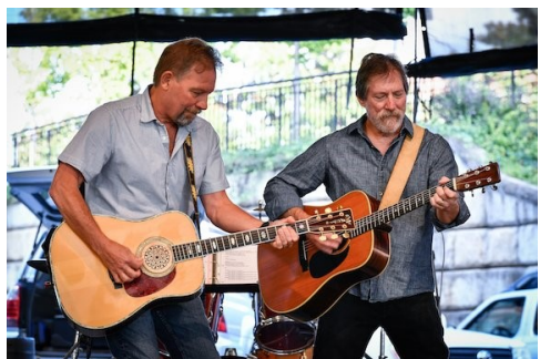
Featuring a private concert of RSC favorites Marshall-Artz!