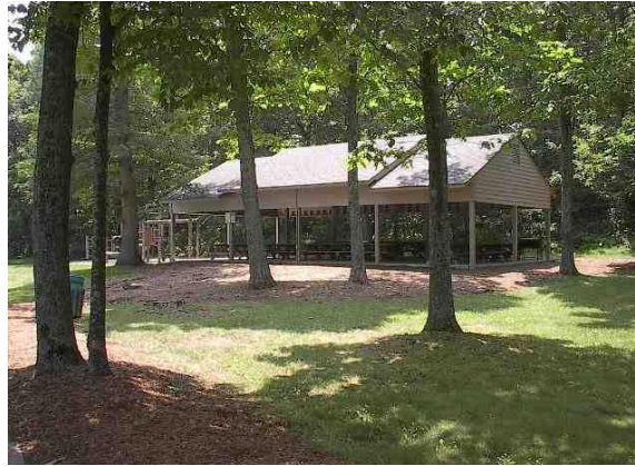
Chestnut Spring Pavilion